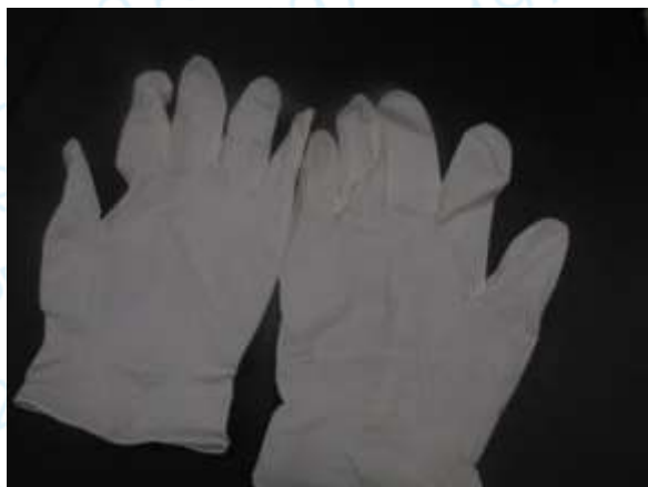
Gloves described as LATEX Powder Free online chlorination Gloves (400869406)